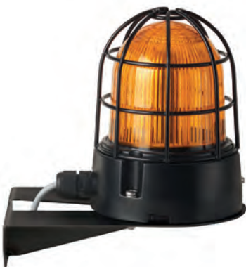
Mounting bracket (accessory)